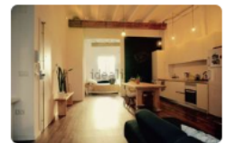
Image of flat in calle de Iluís de santàngel, 29...