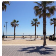
Valencia (Spain). Playa Las Arenas