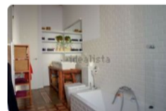
Image of flat in calle de Iluís de santàngel, 29...