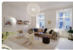
Гостиная в скандинавском интерьере