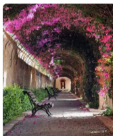
Valencia (Spain) - bougainvillea walkway