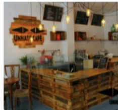
want to go: Unhate Café, in Ruzafa