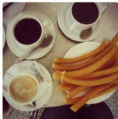
Try decadent churros and chocolate in #Valencia...