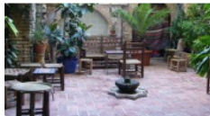
Patio en Ruzafa Valencia (Spain)